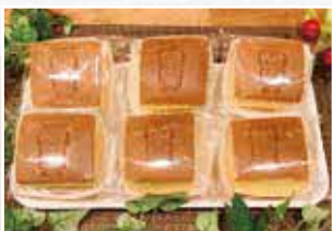
Tachiaigawa Ryo-kun Castella Cake: ¥270 each

Inquiries: Shinagawa Tourism Association, Tel: 03-5743-7642; Culture and Tourism Strategy Section (Tel: 03-5742-6913, Fax: 03-5742-6893)