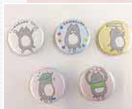
Shina-Nyan Tin Badges ¥300 each