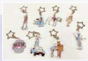
"Horseracing Club Friends Goods" Capsule Toys: ¥300 each

"Horseracing Club Friends Goods" Hand Towel: ¥1,800