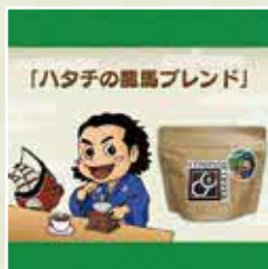
Hatachi-no Ryoma Blend Coffee: ¥680/100g

Shinachiru Mama-no Yasaibatake (1-1-18 Minami-Oi)