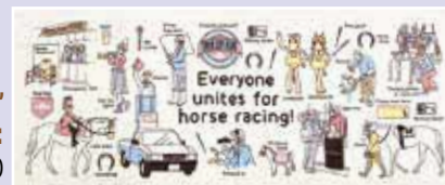
"Horseracing Club Friends Goods" Slim Thermos Stainless Bottle: ¥2,200

Champions TCK (Oi Racecourse, 2-1-2 Katsushima)