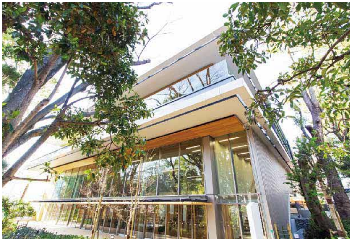
The south-facing exterior of the facility

ECORU Togoshi is a municipal facility where you can learn about the environment, attend exchange programs and more. The facility, which opened in May within Togoshi Park, offers visual exhibits that simulate the relationship between how we live and the natural environment, as well as hands-on permanent exhibits that emphasize the senses of sight, hearing and touch. In addition, the facility conducts various events and classes so that visitors can enjoy learning about the environment. ECORU Togoshi also has a community lounge, kids space and rental rooms, allowing city residents and those at the park to use the facility as a place to relax and enjoy friendly exchanges.