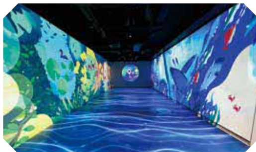
Video Exhibit (touching virtual living creature)

This space hosts events and classes for everyone from children to adults to bring us all closer to nature.