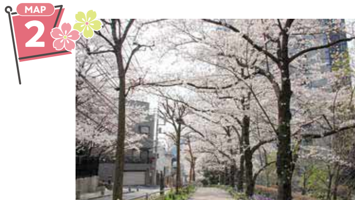
The slope of Gotenyama

Tennozu Isle, Shimbamba, Osaki, Gotanda, and Fudo-mae