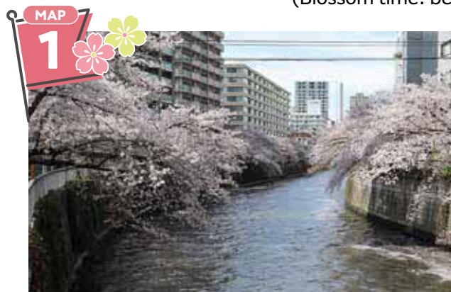
Cherry Blossoms along the Meguro River

(Blossom time: between late March and early April)