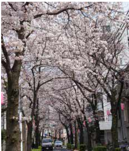
Tachiai-doro Street and Cherry Tree-Lined Street in Nishi-Koyama

Nishi-Koyama Station and Hatanodai Station