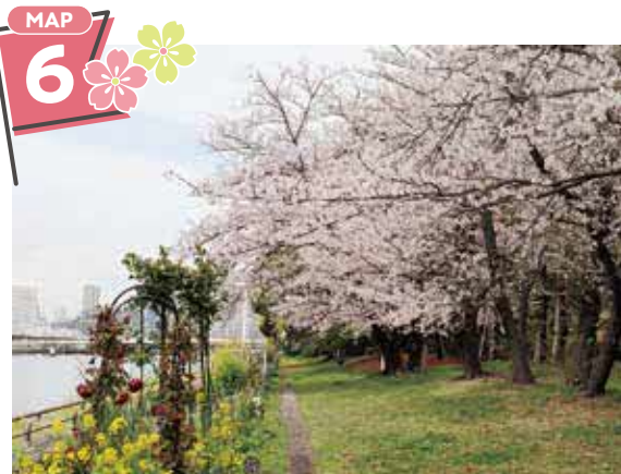
Near Keihin Canal Green Way